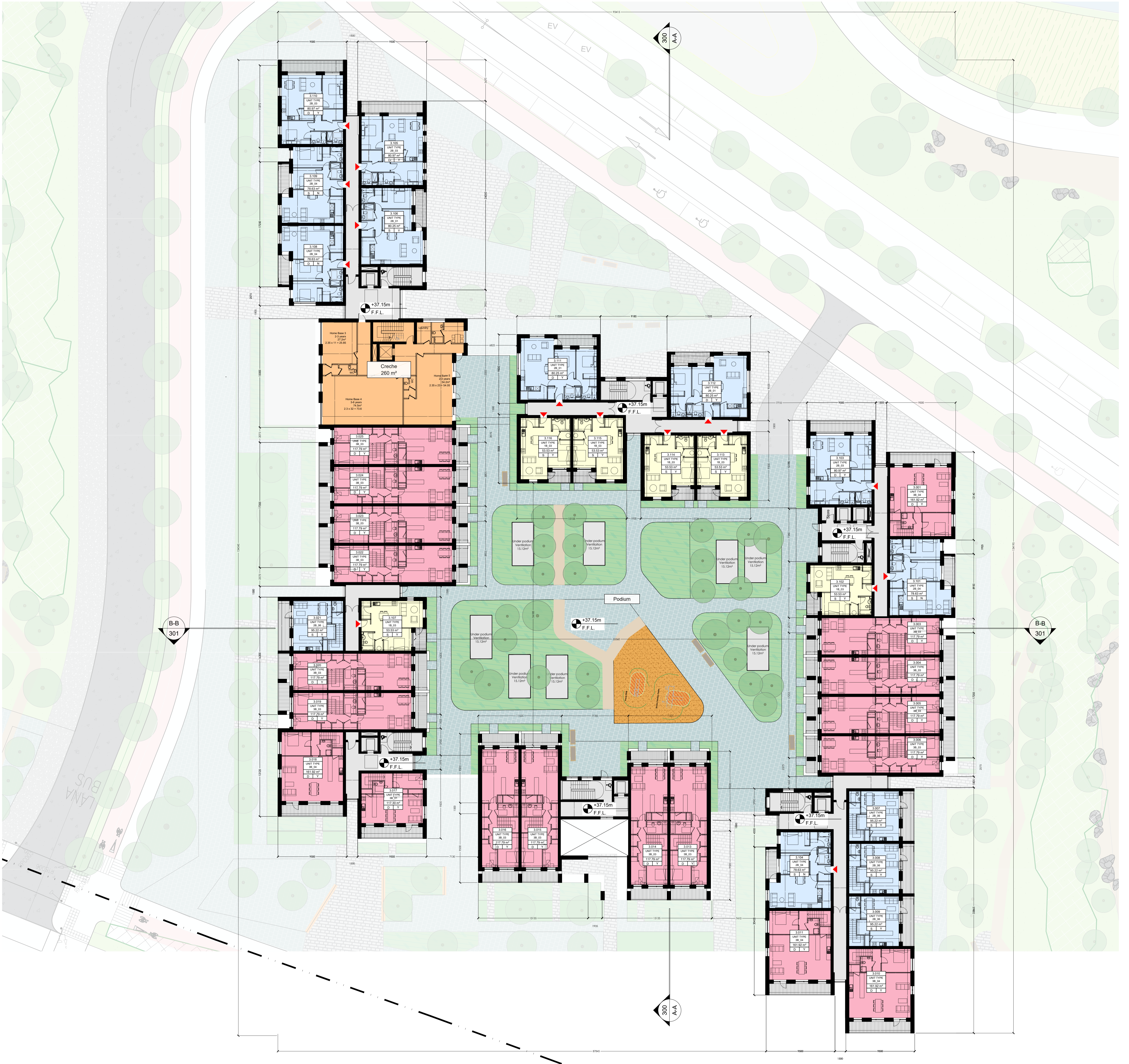
1st Floor Plan - Block 3 Scale 1:200 @A0